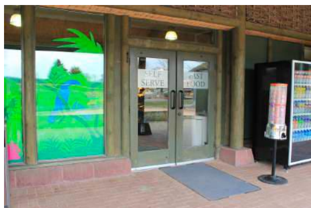
Oasis restaurant right hand doors by play area

Once inside, our décor includes a large rock face on either side of the main doors that as it’s narrowest point is 145cm wide. The restaurant has a serving area where the food is purchased and placed on a tray. Members of the catering team will offer to carry trays for those who require assistance.