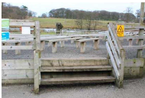
Steps to outdoor seating, ramp access available