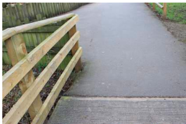
Access to meerkats via bridge

This bridge may prove difficult for those using mobility scooters.