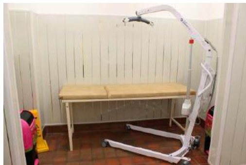
Adult changing facility

Access to the two disabled toilets is by a 92cm wide door with forward transfer to the WC – this may be awkward for some wheelchair users, and may require further assistance. There is sufficient turning space at the entrance to the facility and a horizontal rail on the rear of the door.