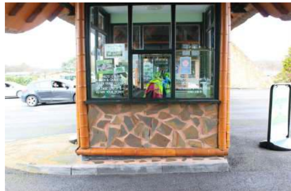
Window height 100cm

Pedestrian entrance, whilst unadvised, is safest on the left hand side of the drive up, leading to Coach Reception.