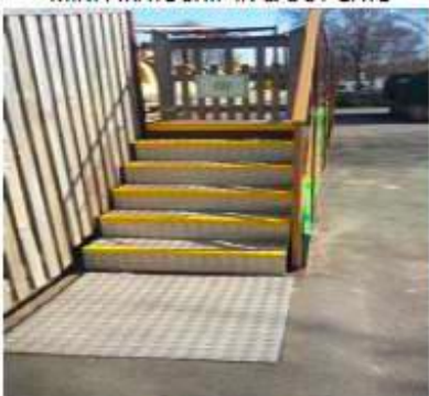
RATTLESNAKE IN GATE