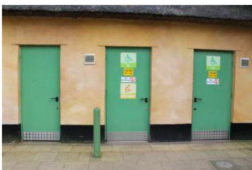
Disabled toilet entrance

We also offer an adult hoist and changing facility. Unfortunately, we don't have braille or tactile signage.