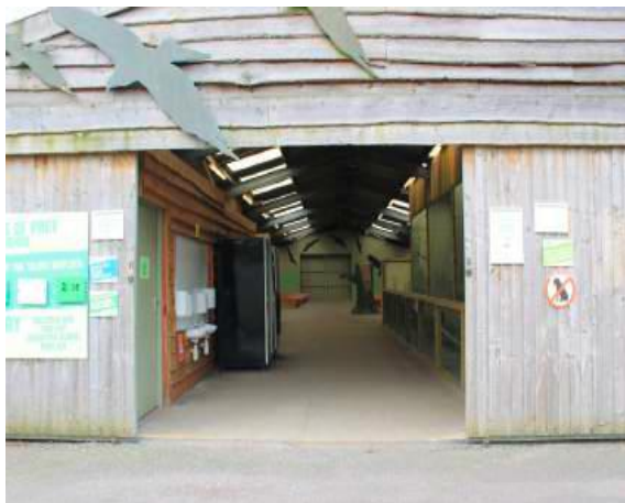
Entrance to indoor aviary

Our indoor aviaries can be accessed by a large slide doorway allowing plenty of movement and turning space once inside.