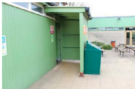
Access to ladies' toilets

General toilets are situated opposite via paving stones, both entrances are by a 74cm wide doorway. The gentleman's toilets have a small 8cm step into the building.