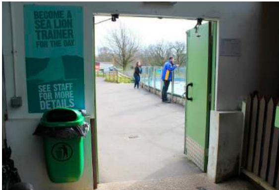
Internal view of access door

Access to our sea lion auditorium is by 150cm wide fire doors, which our staff open and close. On ground level at the front of the stand seating is a space reserved for those who require wheelchair access or seating with backs can be provided.