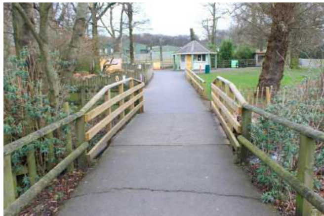
Access to meerkats via bridge

There are green areas around the foot safari, including the main lawns surrounding our Oasis Restaurant, the picnic area opposite our elephant paddock and the planted borders leading up to the safari drive. These areas are also reachable via alternative pathways.