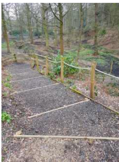
Wild Trail – shallow steps

Half way around our Wild Trail (allowing for great views of our European Moose) you will come to a series of small steps or bridges.