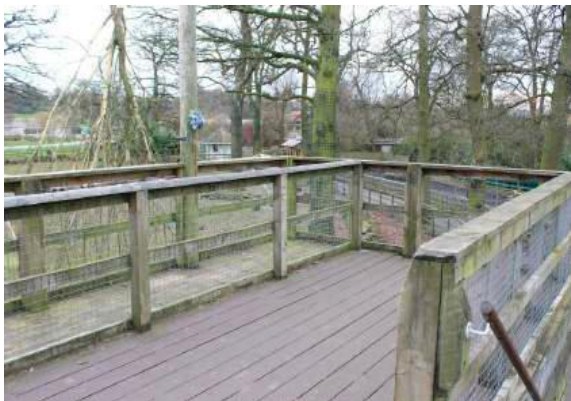
View of giraffe platform

Access through and around our giraffe house is by tarmac pathways firstly leading to our giraffe viewing platform comprising of 13 steps (170cm wide) with handrails on both sides with gripping material.