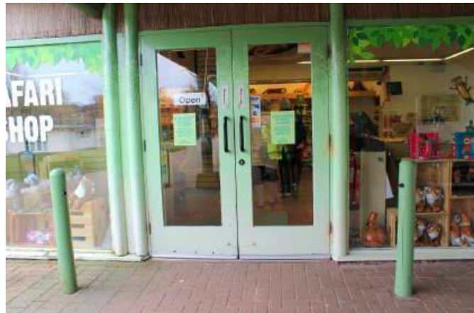
Shop front door entrance

Located next door to the Oasis Restaurant and accessed from the car park via dropped kerbs, our spacious and light gift shop can be accessed by pull doors 169cm wide.