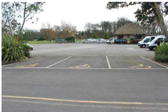
Disabled parking spots

Cars are required to come down a slight slope to occupy a space in the car park. Once in the parking area, guests will notice that whilst the surface is concrete, it can be uneven in places.