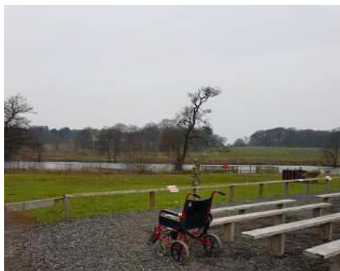
Wheelchair seating on uneven ground

Due to the flight paths and arrangement of our Bird of Prey displays, wheelchair accessibility may require assistance on uneven ground.