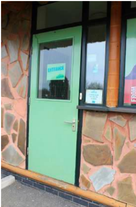
Coach reception front door

Coach reception front door is 80cm wide, and accessible via a 25cm step.