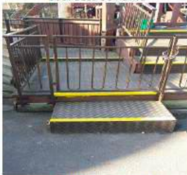
PIRATE SHIP IN & OUT GATE