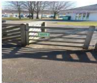
BUSY BEES OUT GATE