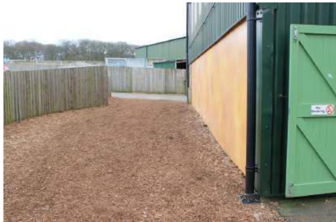
Wood chip pathway to Equatorial Trail

Surrounding our giraffe house leading to our equatorial trail viewing platform is bark chip walk ways which wheelchair users may find difficult to navigate, but in most cases the giraffe house doors will allow easy access.