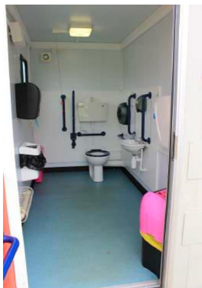
Internal view of disabled toilets