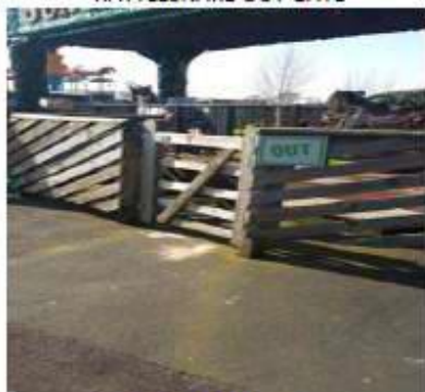
JUNGLE SAFARI OUT GATE