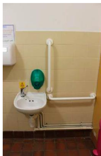
Internal view of disabled toilets

General toilets are situated opposite via paving stones, both entrances are by a 74cm wide doorway. The gentleman's toilets have a small 8cm step into the building.