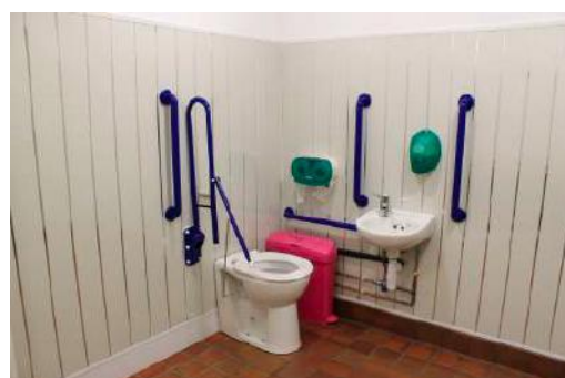
Internal view of larger disabled toilet