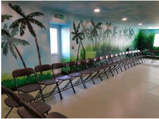
Internal view of Rainforest room

Our exciting new party rooms can house classroom sessions and birthday parties. Access is by ground level doors of which there are two 76cm wide doors or double 150cm doors.