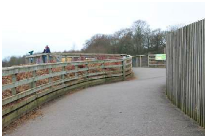
Incline leading to viewing platforms

An incline leads to our viewing platform overlooking our tapir/sitatunga and Mizzy lake, with decking allowing plenty of room for turning around.