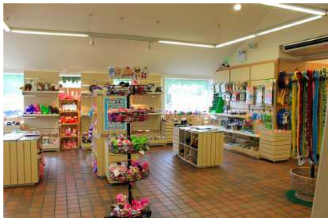
Internal view of shop

Once inside the gift shop, wide aisles allow for sufficient turning space for wheelchair users, and the store includes low level counter tops for ease of use.