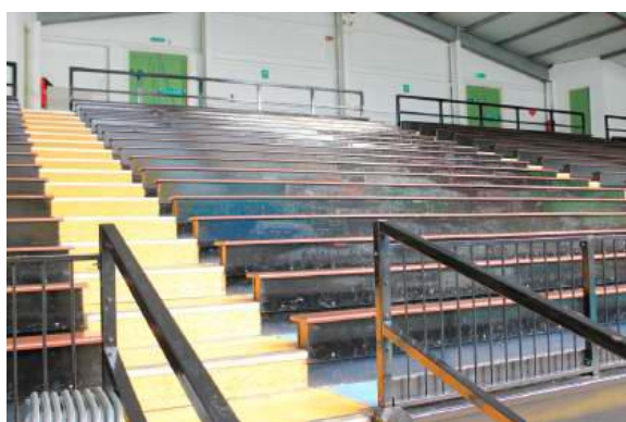
Internal grandstand seating

Seating is strictly first come first serve- those positioned at the centre of the stage maybe find they will get wet at the end of the show from the sea lion high ball jump. Assistance may be required.