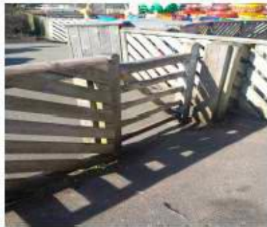
BUSY BEES IN GATE