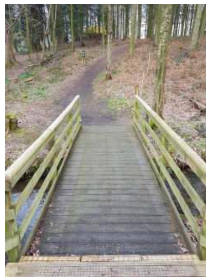
Wild Trail – steps and bridge