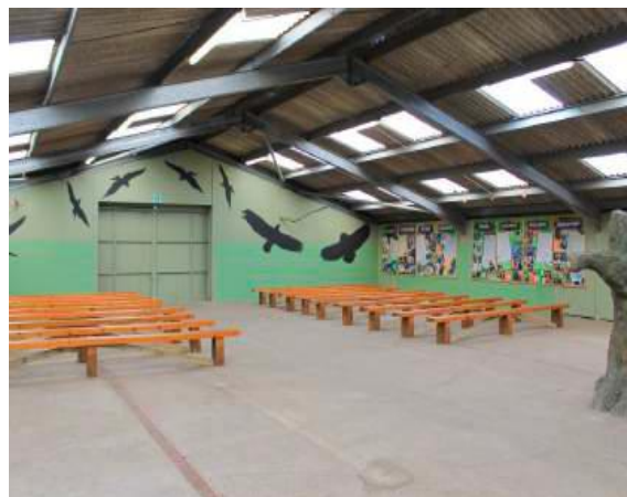
Seating for indoor displays

We will advise guests where to sit safely in the bird of prey arena depending if the show is inside or outside. It is our staffs' discretion on placement when shows are in progress.