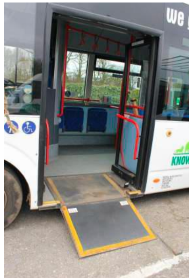
Wheelchair access on bus

Our larger 33-seater Baboon Bus has a retractable wheelchair ramp allowing easy access for one wheelchair user. We ask for 48+ hours notice when wishing to book on our Baboon Bus with wheelchair facilities.