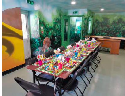
Internal view of Habitats room