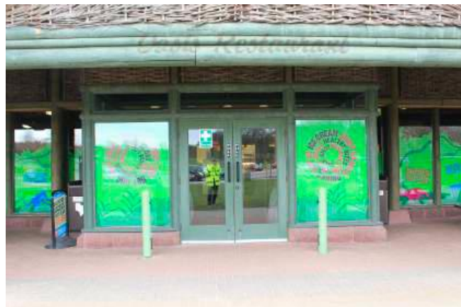
Oasis restaurant front entrance doors

The main entrance is located to the centre of the building, and is 170cm wide - these are propped open during the majority of the year although may be closed (and require push opening) during the colder months. There are two further doors to each side of the building – one opening onto the souvenir shop and toilet block pulling outwards and measuring 166cm wide, and one to the children’s play area and amusements measuring 132 cm wide.