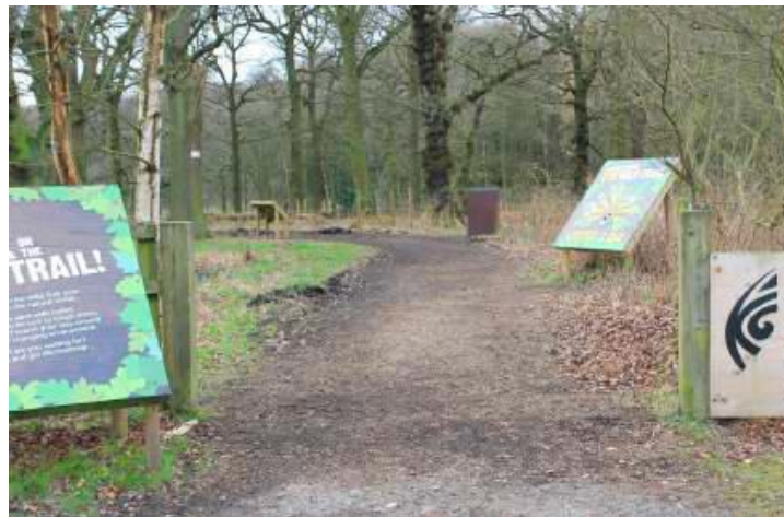
Entrance to Wild Trail

A newer addition to our foot safari is a picturesque wooded area, known as the Wild Trail, teeming with native wildlife and our European Moose.