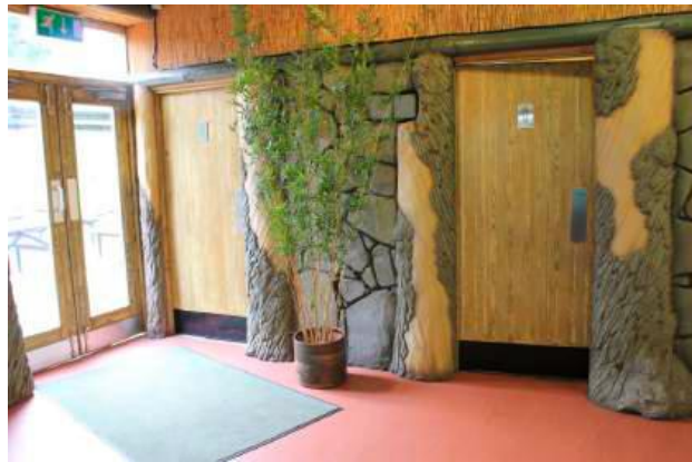
Internal view of Oasis Restaurant toilets

Located within the Oasis Restaurant are two general access toilets with 80cm push doors without handles.