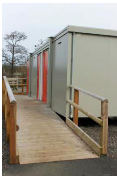
Ramp access to toilets

There are also horizontal and vertical grab rails either side of the WC. Cubicles are well lit with a linoleum level flooring. Assistance may be required by some users.