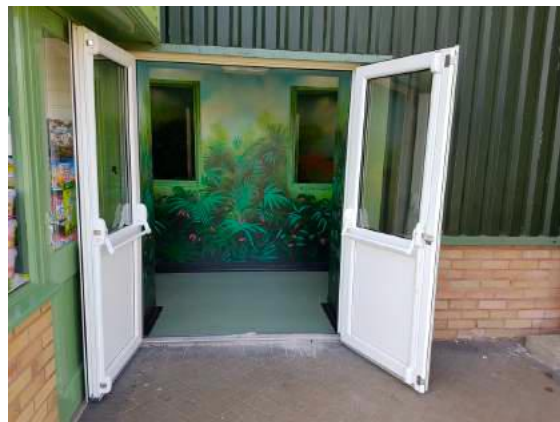
Double door access