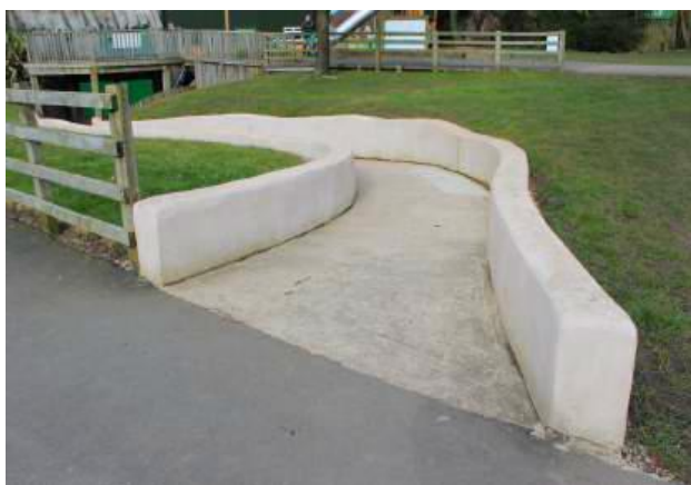
Ramp to underwater viewing window

A viewing platform can be accessed by a wooden decking area with ample space to turn. While we provide steps with a handrail, our underwater viewing window is accessible via a shallow ramp at its narrowest point, 140cm wide.