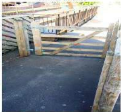
IN QUEING GATE PIRATE SHIP