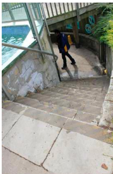
Steps to underwater window

A viewing platform can be accessed by a wooden decking area with ample space to turn. While we provide steps with a handrail, our underwater viewing window is accessible via a shallow ramp at its narrowest point, 140cm wide.