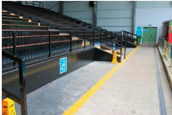
Front access disabled seating area

Regrettably, pushchairs and prams are not permitted in the sea lion auditorium. Our staff will advise guests where to sit safely. Maximum capacity for wheelchair access is 26 wheelchairs or 13 if one to one carers are required to sit at the front also.