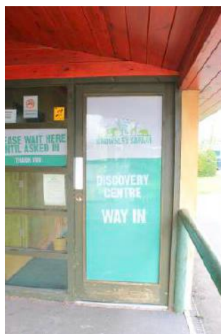
Main door access

There is a horizontal rail on the rear of the door, as well as both horizontal and vertical grab rails either side of the WC. Level flooring through-out with the WC area featuring linoleum finish.