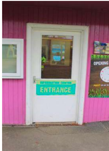
Information centre front door

Access to our information centre is via a ground level doorway 80cm wide. There is sufficient turning space once inside the facility. A lowered 90cm counter can be found inside.