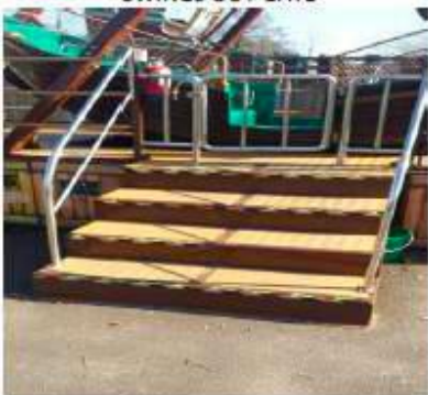
MINI PIRATE SHIP IN & OUT GATE