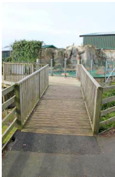
Boardwalk to viewing platform

Surrounding our sea lion auditorium are the outside pool and viewing areas. The glass barriers surrounding the pool are near to ground level and provide excellent views of our animals swimming.