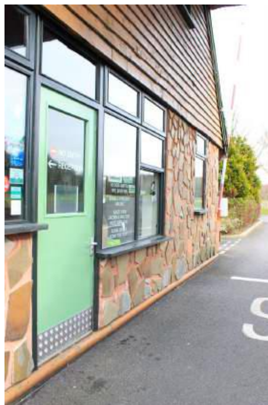
Coach reception side window