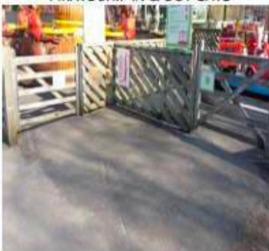
IN & OUT BEARS & ROUNDABOUT