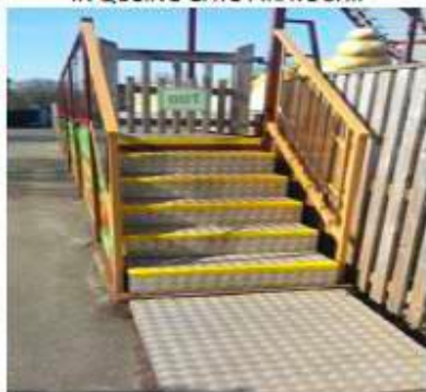
RATTLESNAKE OUT GATE