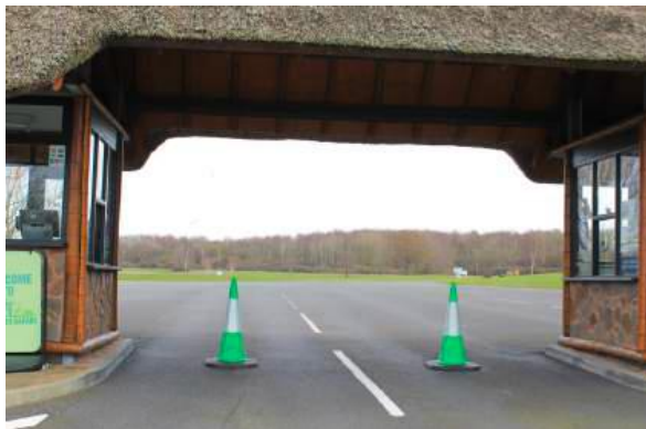
View of entrance kiosks from vehicle