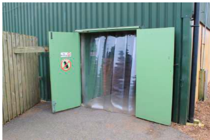
Giraffe house entrance from Equatorial trail

Our giraffe house entrance thorough-fare is by two double doors 170cm wide with heat protection flaps which may require some assistance to navigate.