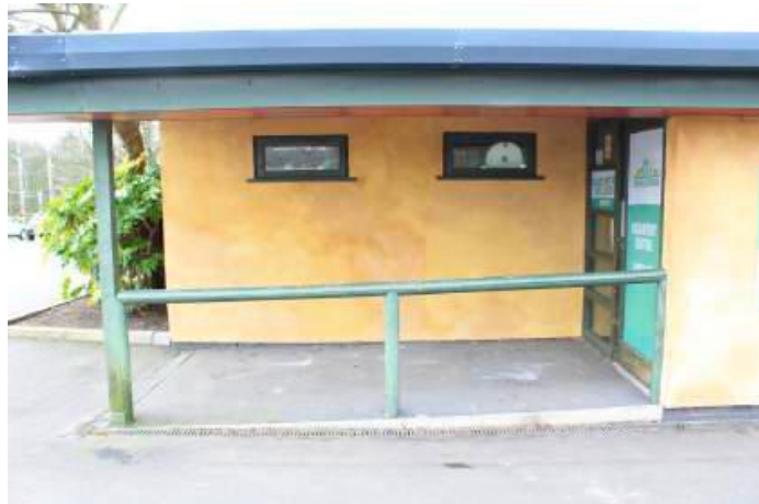
Discovery Centre entrance ramp

There is sufficient turning space once inside the facility as well as a fire exit 90cm wide, that may be used if required.