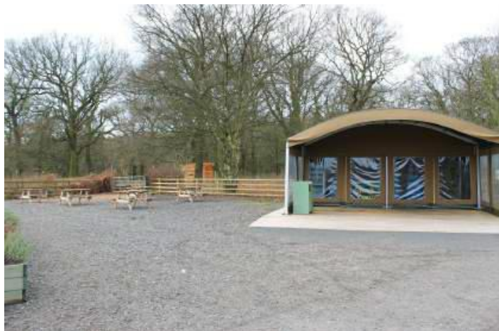
Woodland picnic and café area

Opposite our bird of prey centre are a set of toilets accessible by some hard standing/gravel to a wooden ramp with handrails on both sides. Comprising of two regular and one disabled toilet block. Doors are 80cm wide with a small ground level lip.