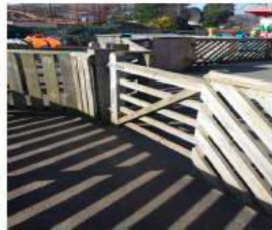
SWINGS IN GATE