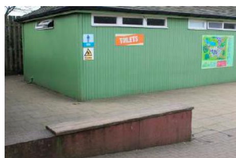
Access to men's toilets