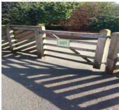
SWINGS OUT GATE