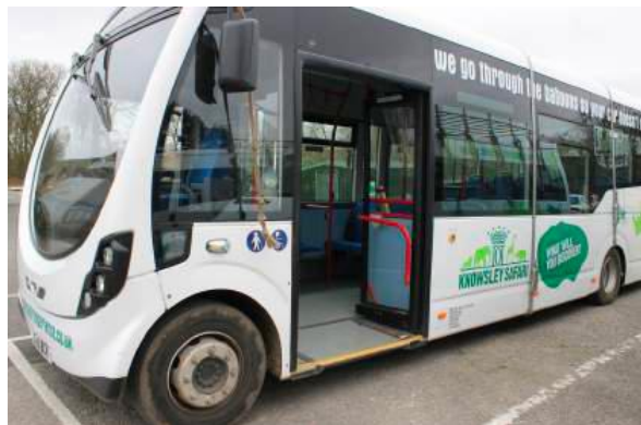
Side view of Baboon Bus

Our Baboon Bus can take between 1 and 2 hours to go around the safari drive, with a current option for toilet breaks for leaving the vehicle.